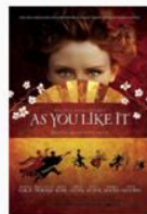
As You Like It